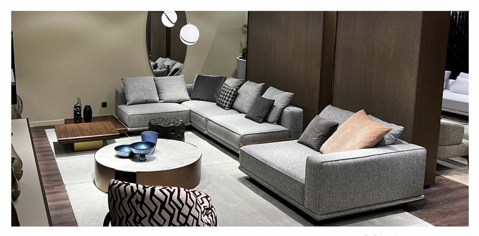
LUXURY SOFA SAGISTGROUP 01