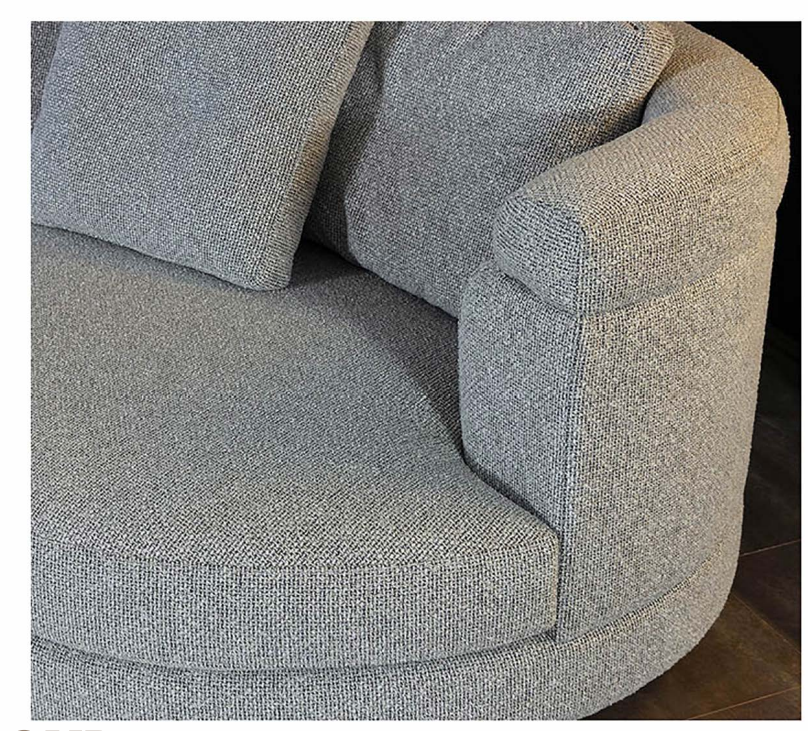
LUXURY SOFA SAGIST GROUP 15