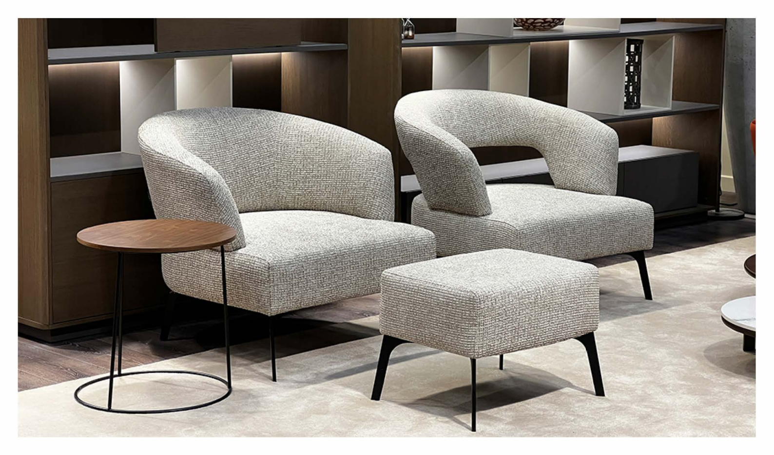
LUXURY SOFA SAGIST GROUP 18