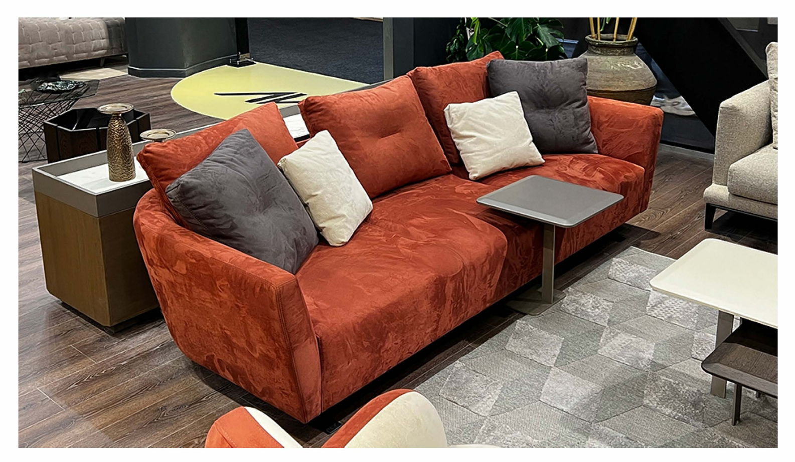
LUXURY SOFA SAGIST GROUP 12