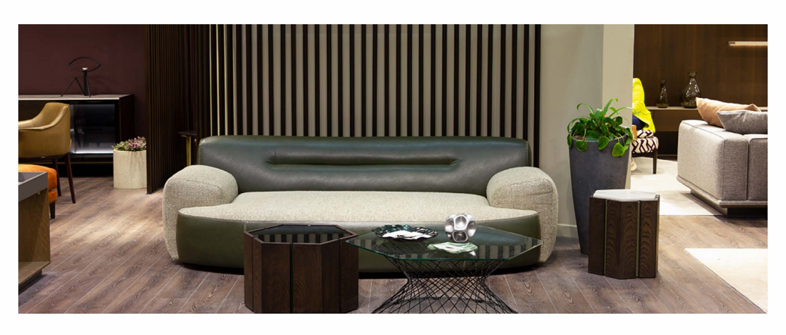
LUXURY SOFA SAGIST GROUP 08