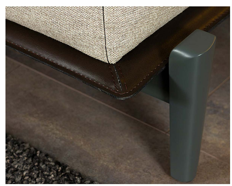
LUXURY SOFA SAGIST GROUP 13