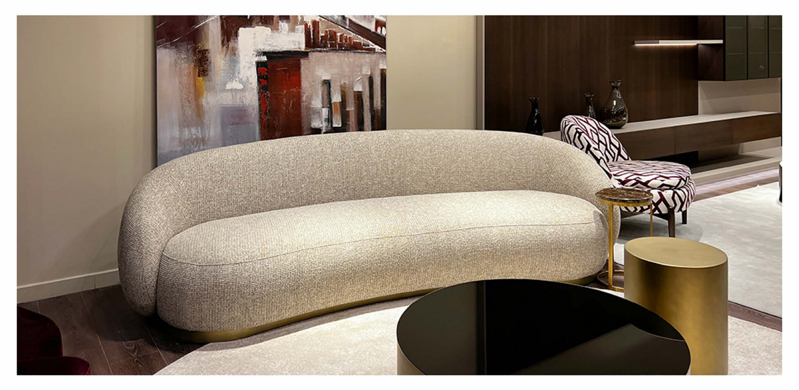
LUXURY SOFA SAGIST GROUP 09