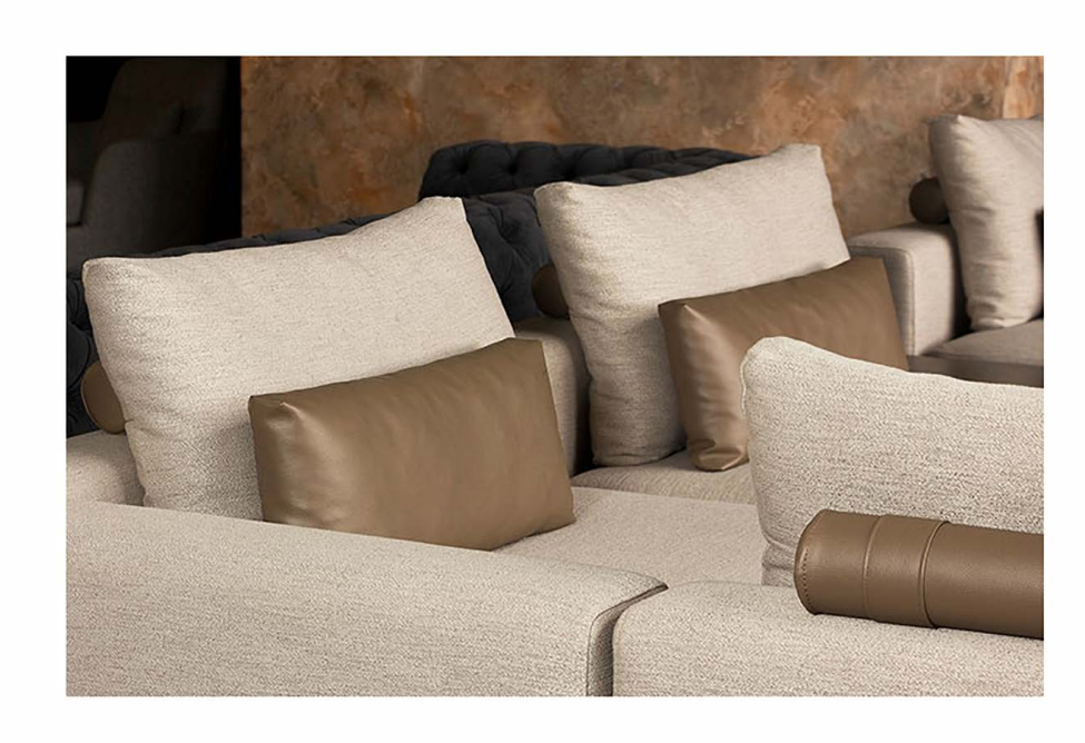
LUXURY SOFA SAGIST GROUP 06