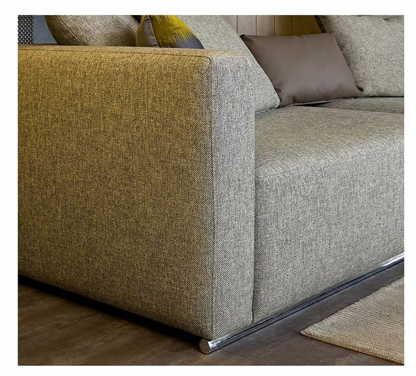
LUXURY SOFA SAGIST GROUP 16