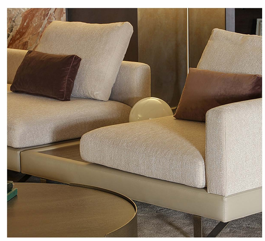
LUXURY SOFA SAGIST GROUP 07