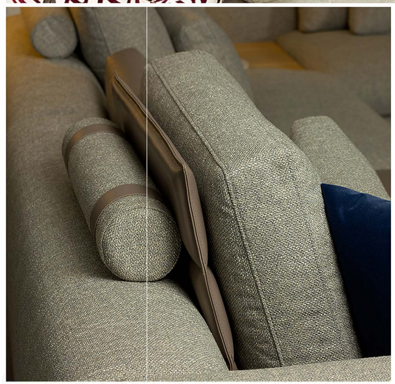
LUXURY SOFA SAGIST GROUP 04