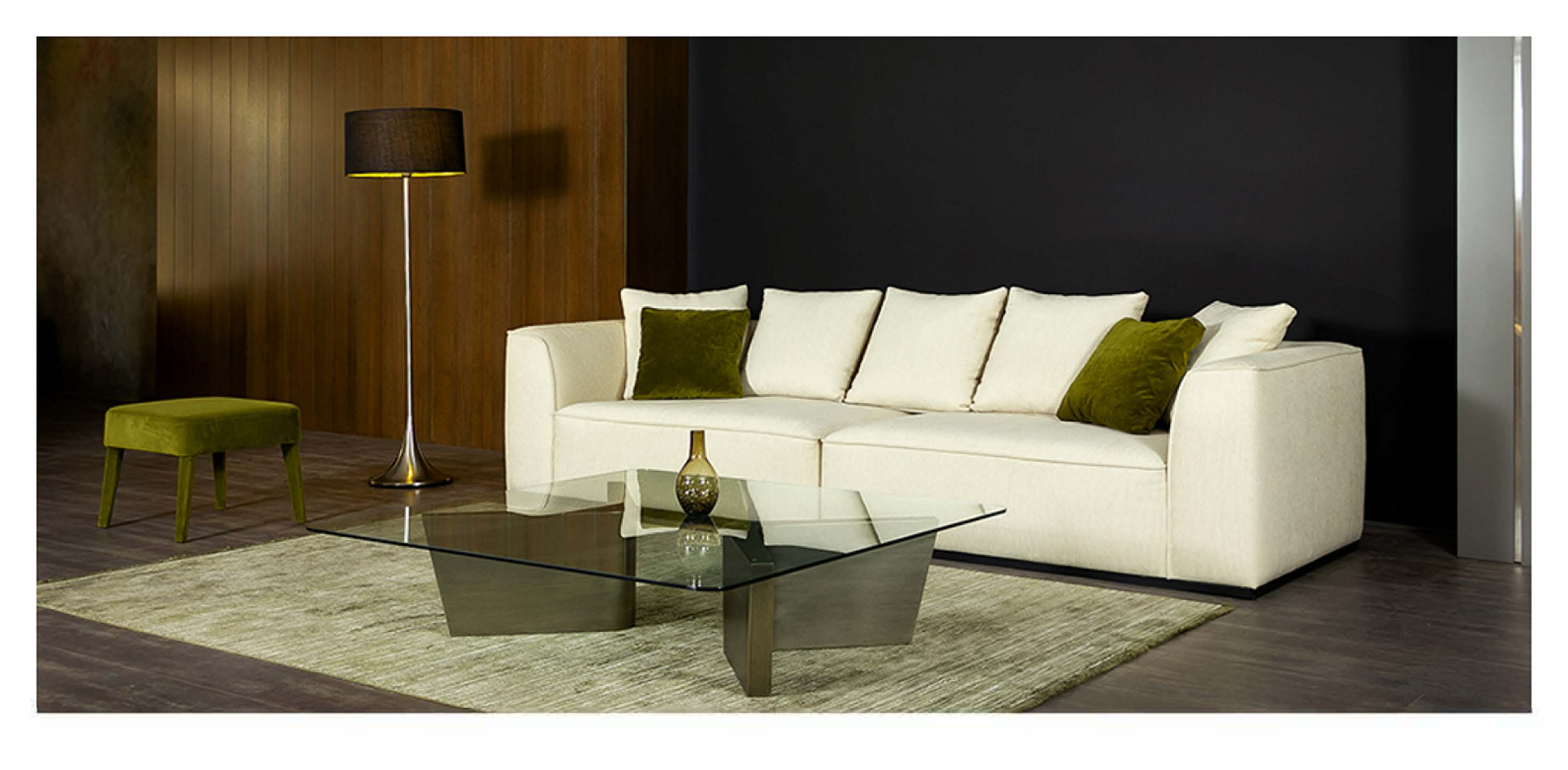
LUXURY SOFA SAGIST GROUP 17