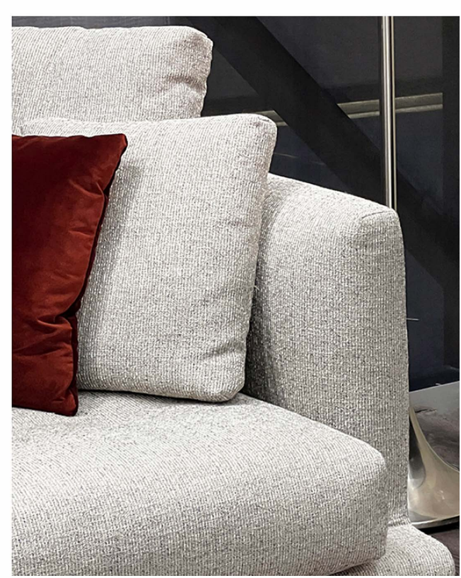
LUXURY SOFA SAGIST GROUP 10